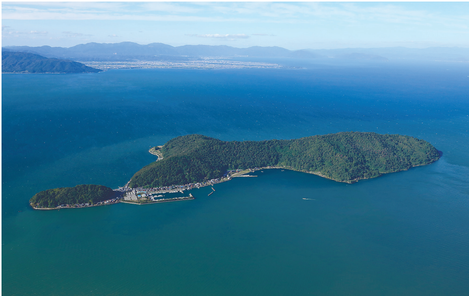
Lake Biwa’s Okishima is the only populated lake island in Japan.