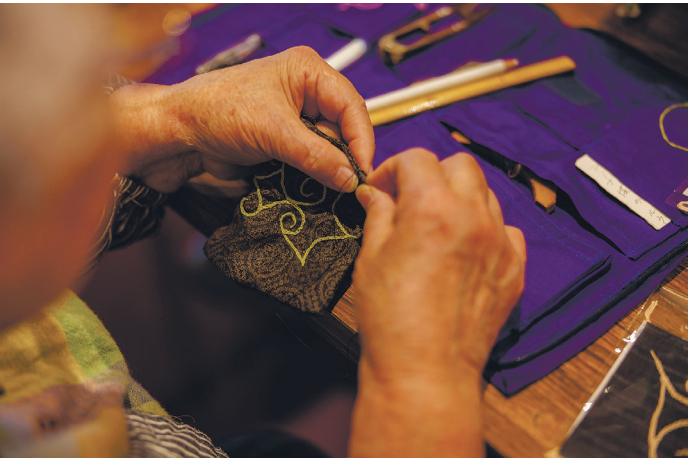
A variety of handicrafts are displayed during Roots and Arts Shiraoi in Hokkaido.

The Japan Cultural Passport is a digital pass that lets you explore about 30 cultural facilities nationwide with just a QR code on your smartphone. From cultural properties and modern art to science and technology, it eases access to a wide variety of attractions in a convenient and cost-effective way.