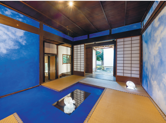
An installation of cloud sculptures titled “Enku” by Julien Signolet is shown at the Biwako Biennale in 2022.