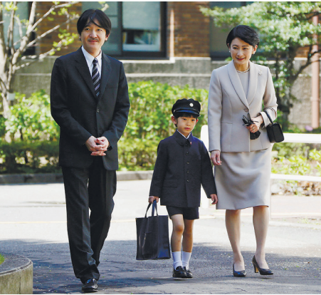
The prince, his father and Princess Kiko attend the prince's entrance ceremony at Ochanomizu University Elementary School on April 7, 2013.

Best Wishes to His Imperial Highness Prince Hisahito on the Occasion of his Coming-of-Age Ceremony