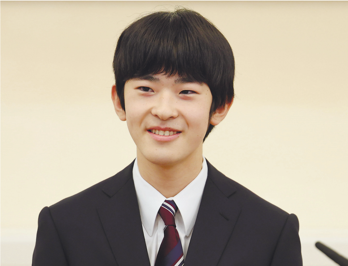
Prince Hisahito speaks at a news conference on March 3. Far left, top: The prince and his father Crown Prince Akishino (right) examine a hornet's nest during a visit to Tamagawa University's insect science laboratory in Machida, Tokyo, on April 6. Far left, bottom: The prince attends his entrance ceremony at the University of Tsukuba in Ibaraki Prefecture on April 5.