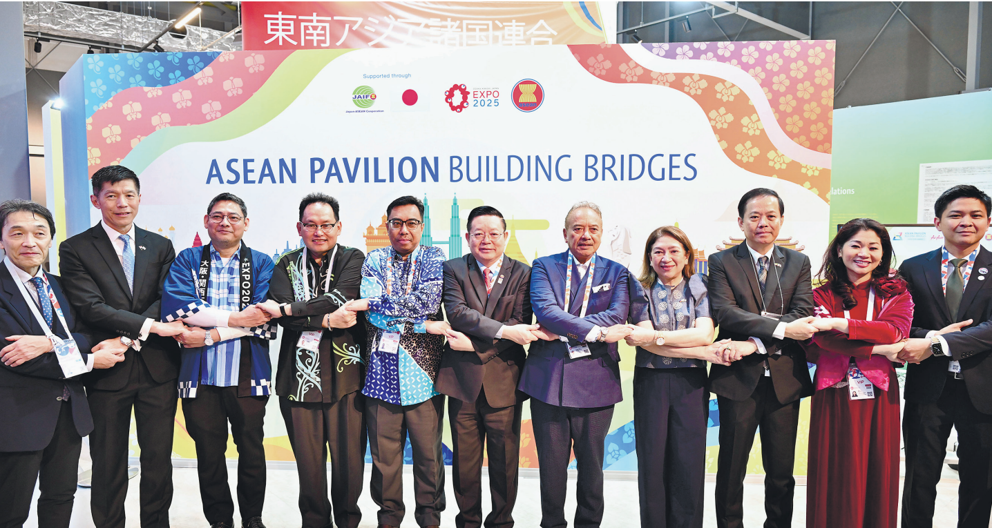
Under the theme of “Building Bridges,” the ASEAN Pavilion at the Osaka Expo showcases the multifaceted work of the group across the region.