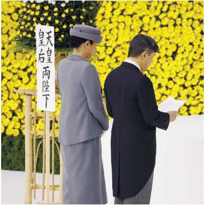
The imperial couple attend a memorial ceremony to mark the 78th anniversary of Japan's surrender in World War II, at Nippon Budokan on Aug. 15, 2023.