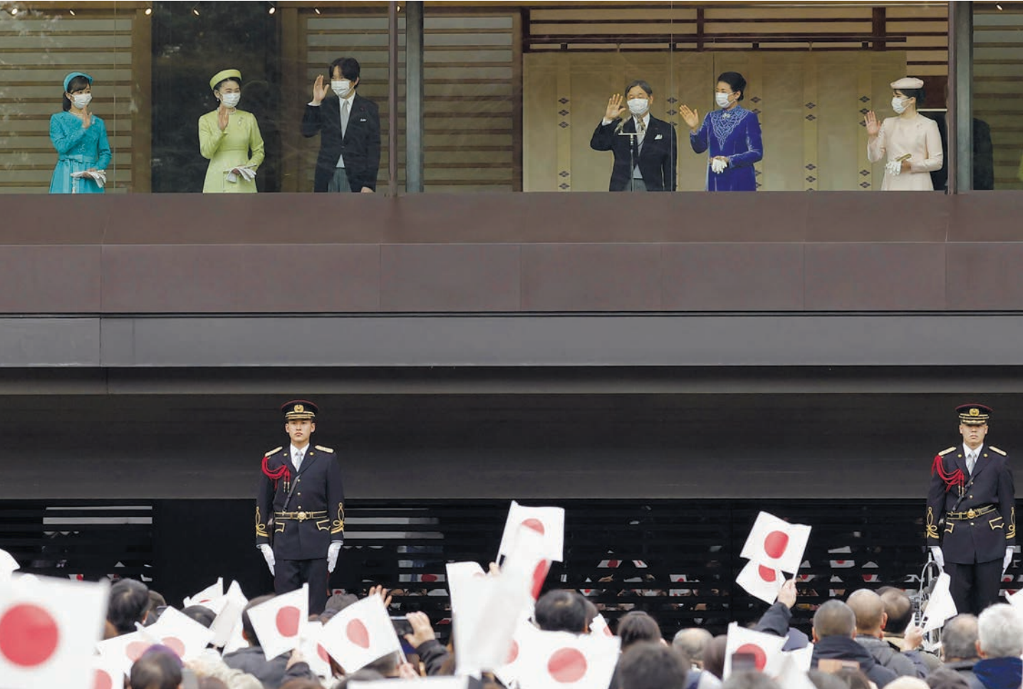
Princess Kako, Crown Princess Kiko, Crown Prince Fumihito, Emperor Naruhito, Empress Masako and their daughter, Princess Aiko, wave to well-wishers during the emperor's 63rd birthday celebration at the Imperial Palace in Tokyo on Feb. 23, 2023.