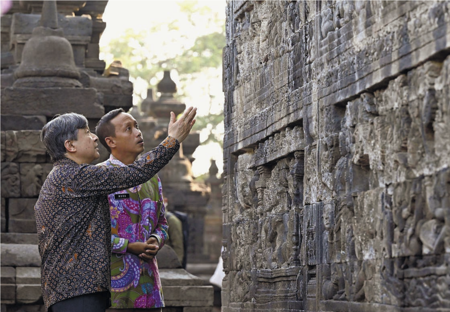
Emperor Naruhito pays a visit to Borobudur temple in Yogyakarta, Indonesia, on June 22, 2023.