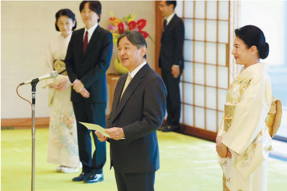
Above: Emperor Naruhito addresses leaders of the Association of Southeast Asian Nations and their spouses at the Imperial Palace on Dec. 18 as Crown Prince Fumihito and Empress Masako look on.