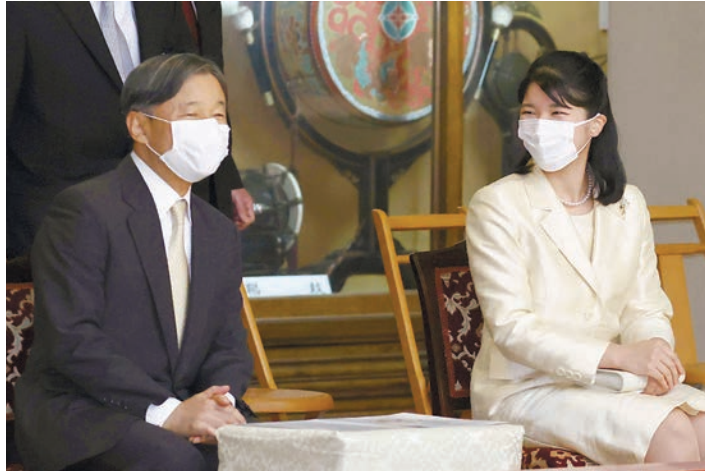
Above: Emperor Naruhito and his daughter, Princess Aiko, watch a traditional court music performance at the Imperial Palace on Oct. 22.

Best wishes to Emperor Naruhito on his majesty's birthday