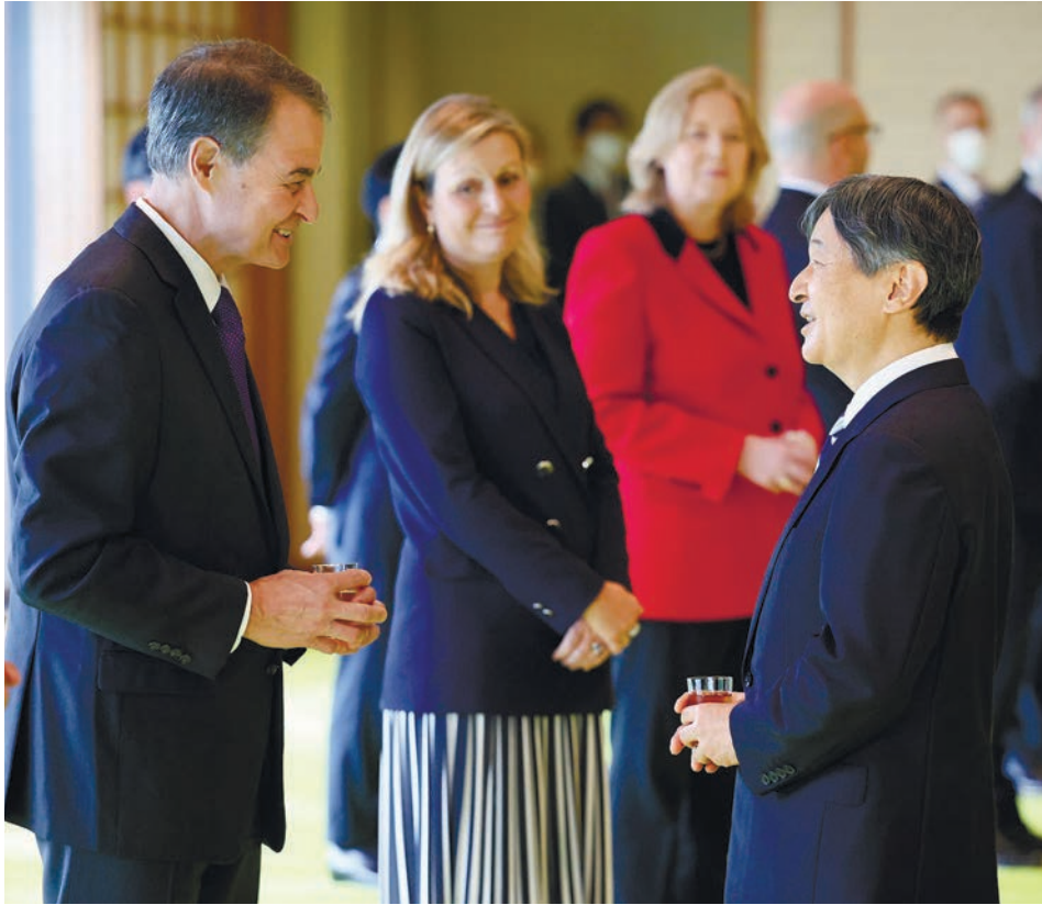
Emperor Naruhito greets participants in the Group of Seven speakers conference in Tokyo on Sept. 8.