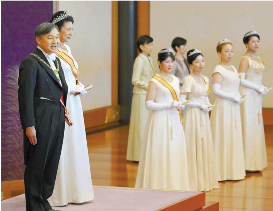
Members of the imperial family join Emperor Naruhito and Empress Masako for a New Year's ceremony at the Imperial Palace in Tokyo on Jan. 1.