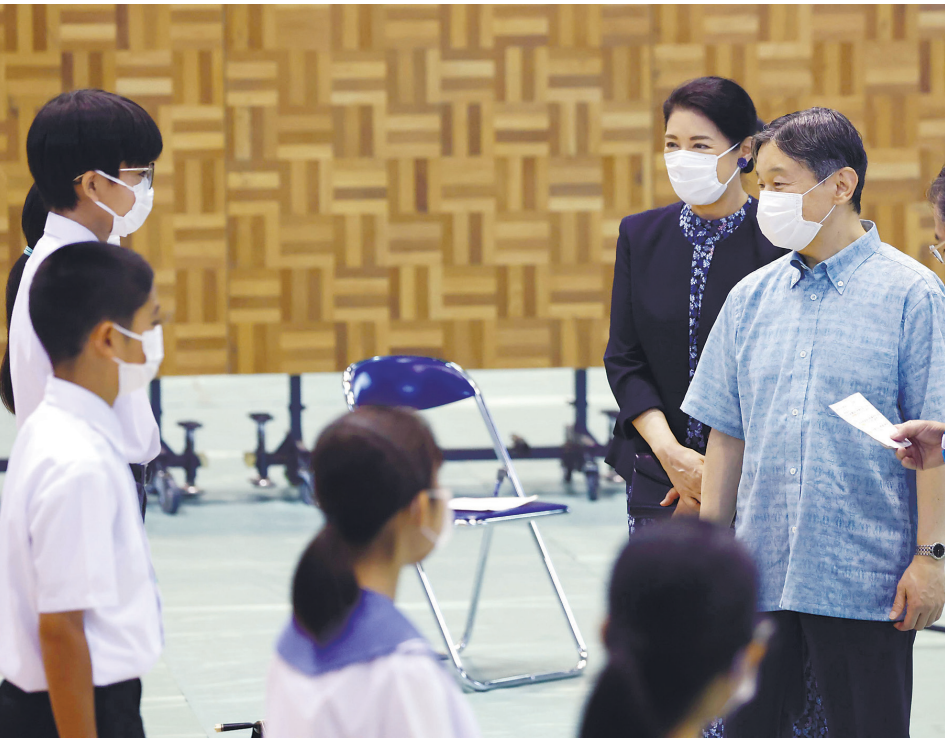
Left: Emperor Naruhito and Empress Masako arrive at a hotel in London on Sept. 17, two days ahead of the funeral of Queen Elizabeth II. Above: The emperor and empress chat with students practicing for a music festival in Ginowan, Okinawa Prefecture, in October.