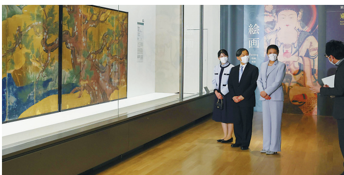
Left: Emperor Naruhito and Empress Masako attend the annual Imperial New Year's Poetry Reading at the Imperial Palace in Tokyo in January 2022. Above: The imperial couple visit the Tokyo National Museum on Nov. 24 with their daughter, Princess Aiko (left).

Best wishes to Emperor Naruhito on his majesty's birthday