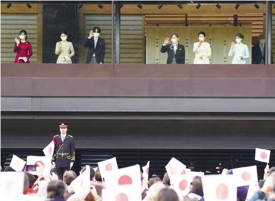
Emperor Naruhito (fourth from left), accompanied by Empress Masako and Princess Aiko, waves to well-wishers at the Imperial Palace in Tokyo on Jan. 2 as Crown Prince Fumihito (third from left) waves with Crown Princess Kiko and second daughter Princess Kako (left).

At the summit, held at Kumamoto-jo Hall under the theme of "Water for Sustainable Development: Best Practices and the Next Generation," the emperor gave a commemorative lecture and made remarks in English during the opening ceremony. In one of his remarks, he referred to Kumamoto as a "sustainable and resilient city" on the way to recovery from the devastating Kumamoto Earthquake in 2016, and touched on the joint efforts of multiple stakeholders "in activities to foster groundwater and conserve the aquatic environment." He also described water as "a cross-cutting issue" that is connected to multiple issues listed among the United