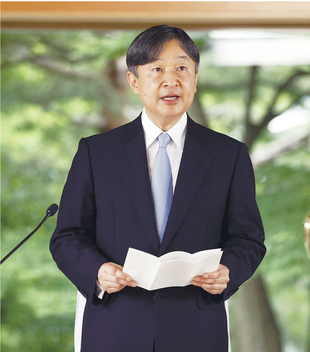
Emperor Naruhito speaks remotely from the Imperial Palace on June 5 to address a national tree-planting ceremony in Koka, Shiga Prefecture.

In November, the emperor visited the Tokyo National Museum in Taito Ward during the special exhibition held to commemorate its 150th anniversary, accompanied by Empress Masako and Princess Aiko. The museum, founded in 1872, is the oldest institution of its kind in Japan and the largest in terms of National Treasures, possessing nearly a tenth of the 902 known