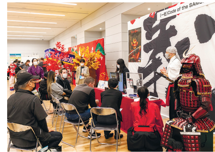
People listen to a presentation about samurai at Expat Expo 2021 at the Tokyo Metropolitan Trade Center's Hamamatsucho-Kan on Nov. 5, 2021.