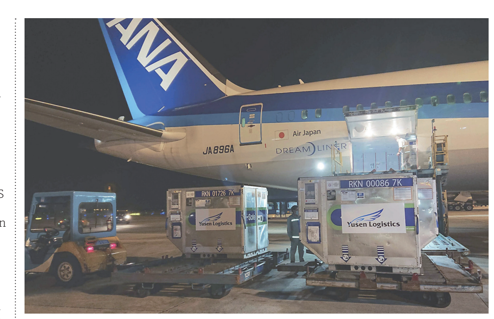
A shipment of Astra Zeneca's COVID-19 vaccine arrives at an airport in Hanoi on June 16, completing Japan's donation of 1 million doses to Vietnam.

The foundation of the ASEAN Centre for Public Health Emergencies and Emerging Diseases was announced at November's summit meeting. The region has experienced a number of public health crises involving infectious diseases since the SARS epidemic of 2003, but the COVID-19 pandemic has caused by far the most disruption and suffering. The new organization will seek to bolster public health emergency preparedness and improve the efficiency of mobilization when these resources are needed. At the summit, Prime Minister Yoshihide Suga pledged to support the center's efforts through the Japan International Cooperation Agency and other avenues.