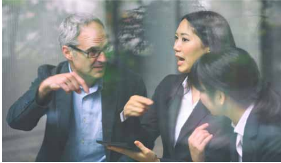
A Master of Business Administration is a highly sought-after qualification for business professionals in Japan.

Demand for MBA holders has been increasing in the global job market. It rose by 13 percent in 2017 from a year earlier, according to the Jobs & Salary Trends Report 2018, published by QS TopMBA.com, which is currently compiling the