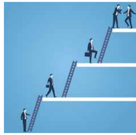
MBAs could help people climb the career ladder.

were improved MBA salary offers tempered by stable compensation levels — a shift from performance-related bonuses to basic salary could be taken as a sign of increased confidence from employers, the report said. The salary in the region rose from $47,500 in 2016 to $57,000 in 2017.