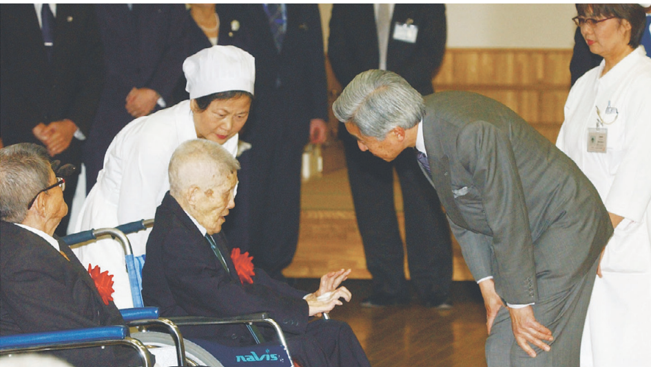
Emperor Akihito bends down to speak with a resident of the state-run leprosy sanatorium Miyako Nanseien on Miyakojima Island in Okinawa Prefecture on Jan. 25, 2004.

In 1991, the couple did just that, startling the public when they knelt down to speak to