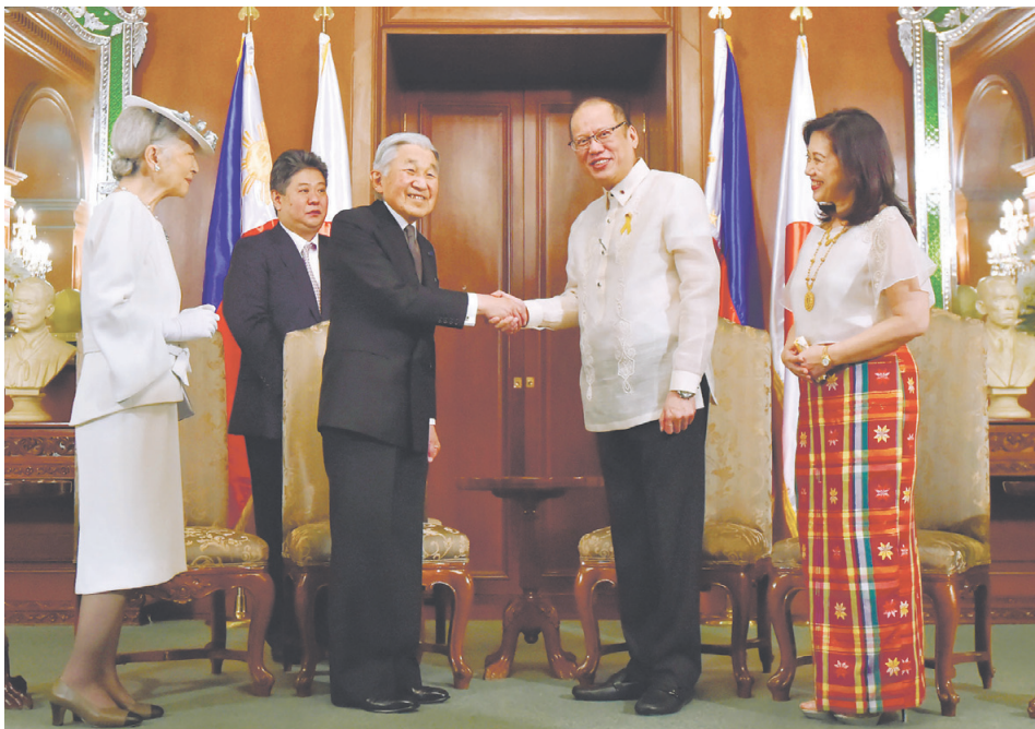
Emperor Akihito and former Philippine President Benigno Aquino shake hands at Malacanang Palace in Manila on Jan. 27, 2016. It was his second visit to the Philippines after his first trip in 1962.

“His majesty’s visits overseas are completely different from those made by prime ministers,” said one of his close aides. “Rather than securing short-term gains, they are aimed at goodwill between countries, which will be evaluated over the long course of history.”