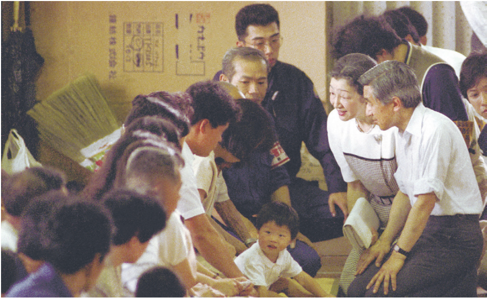
Emperor Akihito and Empress Michiko kneel as they listen to evacuees at a school in Shimabara, Nagasaki Prefecture, after Mount Unzen erupted and killed 43 people in June 1991.

In 1907, the central government adopted an “isolation policy” that forced leprosy patients to live in sequestered facilities across the country. This policy lasted until 1996 when the anti-leprosy law was abolished.