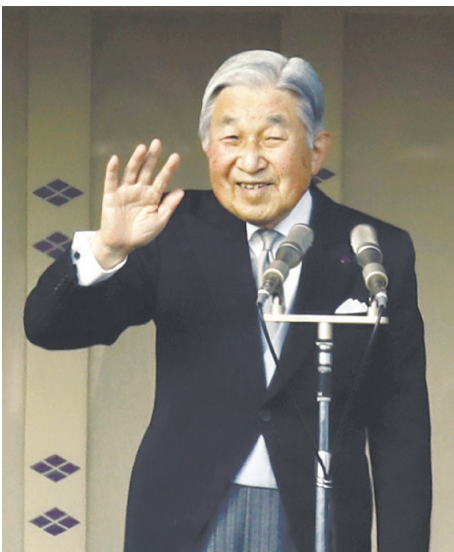
Emperor Akihito waves to well-wishers from the balcony of the Imperial Palace in Tokyo on Jan. 2, 2017.

“Ever since ascending to the throne, I have spent my days searching for what should be the role of the emperor, who is designated to be the symbol of the state by the Constitution. I intend to carry out