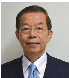
H.E. Mr. Frank C.T. Hsieh Representative

On behalf of the government and the people of the Republic of China (Taiwan), I convey our heartfelt congratulations to His Majesty the Emperor Akihito's 30 years on the Chrysanthemum Throne.