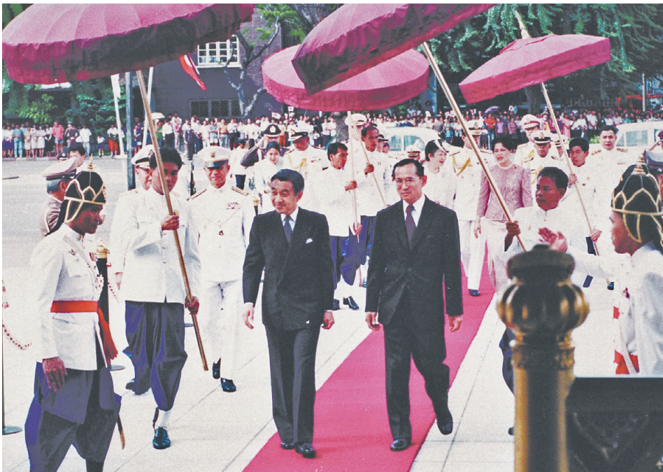
Emperor Akihito and Thailand's then-King Bhumibol Adulyadej in Bangkok in September 1991.

This article was compiled from Kyodo News articles, staff reports and the website of the Imperial Household Agency.